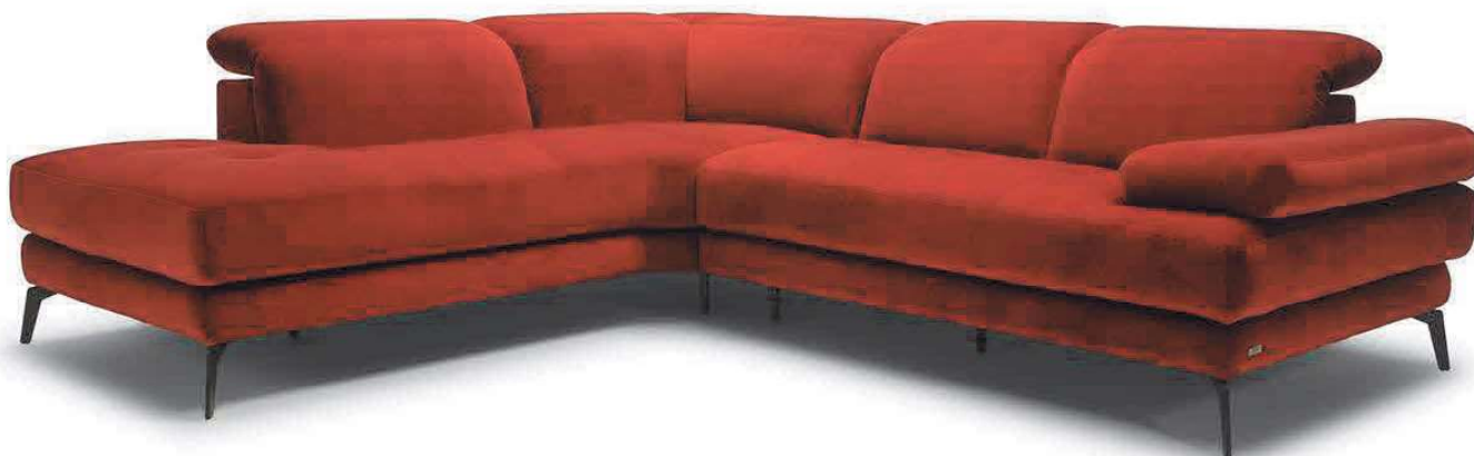
■ Vers. 480+017