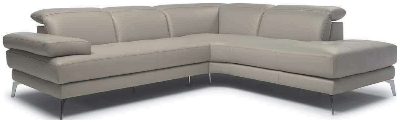
■ Vers. 286+481