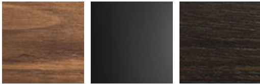
NC walnut canaletto