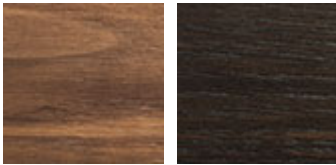
NC walnut canaletto