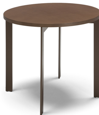
■ T042005XOF / T042005XDD