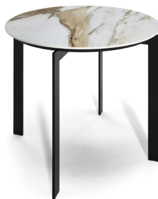
■ T042017XOF / T042017XDD