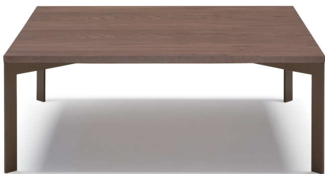
■ T042002XOF / T042002XDD