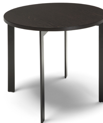
■ T042004XOF / T042004XDD

ALL PICTURES SHOWN ARE FOR ILLUSTRATIVE PURPOSE ONLY. ACTUAL PRODUCT MAY VARY DUE TO PRODUCT ENHANCEMENT.