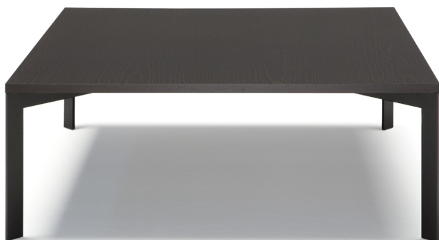
■ T042001XOF / T042001XDD