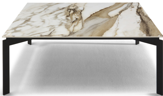
■ T042016XOF / T042016XDD