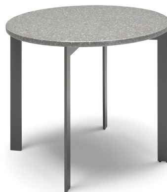
■ T042006XOF / T042006XDD